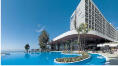
Pestana Casino Park Hotel

Set in its own beautiful gardens, just a few minutes walk from the centre of the capital, Funchal, the 5* Pestana Casino Park boasts an unrivalled position with views across the sea and mountains.