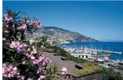
View of Funchal Harbour

There are numerous shops, bars and restaurants within walking distance of the hotel. Wander for hours in Funchal town with its blue sea in front, and the greenery of the mountains behind and its old squares and pavements alive with vibrant Birds of Paradise and Amaryllis flowers.