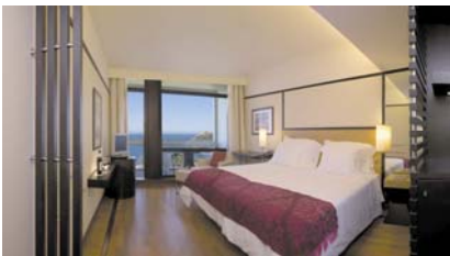
Bedroom at Pestana Casino Park Hotel

Facilities at the Pestana Casino Park Hotel are superb. The large outdoor heated swimming pool is surrounded by sun terraces where you can relax and watch the cruise ships sailing into Funchal harbour below. The hotel has an indoor pool, spa, Jacuzzi, sauna, steam bath, aromatherapy, gymnasium, massage, library, hairdresser and beauty salon, tennis courts, 3 restaurants, café bar, and cocktail bar with live music most evenings.