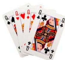
Queen = 2 points