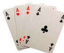
Ace = 4 points

The value of the hand is worked out by counting up the high card points held, using the following scale: