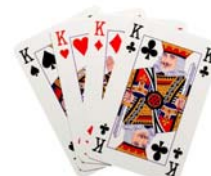
King = 3 points