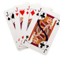
Jack = 1 point

Note that there are 40 points altogether between the four hands in each deal.