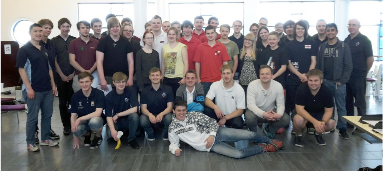
All junior teams and their captains gathered together at playing area.

(You can find this article and all results of the tournament at our web site www.bridgefinland.com .)