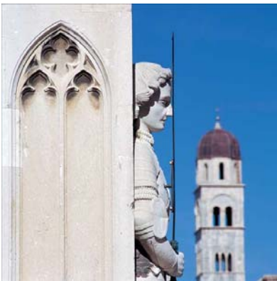
Orlando Sculpture, Dubrovnik

The city has just over 2 km of city walls (built between the 11 th and 17 th Century), which are well worth walking around as the views are spectacular. The most important museums and collections are the Dubrovnik Museum at the Rector's Palace, the Dubrovnik Maritime Museum, Ethnographi Museum and the Cathedral Treasury. There are also many monasteries and churches to visit. A range of optional excursions will be provided to enable you to see the best of Croatia.