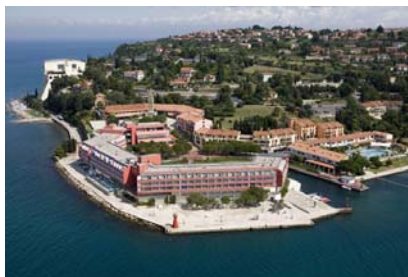
Histron Hotel, Portoroz

The flights are from Stansted. The cost of this holiday is £895.00 per person (including flights). The single supplement is £21.00 per person per night. The sea view supplement is £3.00 per person per night.