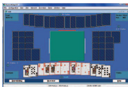
A Q-plus Bridge screen

has a rather old-fashioned look but a playable interface while MicroBridge and Shark Bridge are the least playable of the commercial programs with unattractive interfaces and fewer on-screen controls meaning you have to delve into menus or remember control-key sequences to take back a card or make a claim.