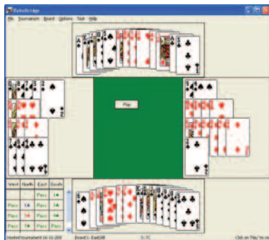
RoboBridge at play

While most programs can suggest what bid to make or what card to play, Jack is particularly flexible and can be set to hint only when requested or to comment on your bidding or play at the time or at the end of the