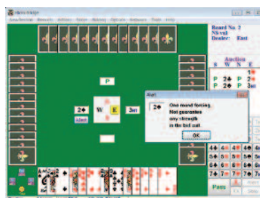
A Microbridge auction

When you have played a few practice hands, you might like to try a pairs tournament or a team of four match. Pairs tournaments usually require the program to have a database of hands and results for comparison with your result. The data may come from an actual event or may be simulated by the program playing the hands many times with different convention cards and/or skill settings. RoboBridge takes a different approach, however, and uses the internet to let different players play the same hands, each with RoboBridge as a partner. You can then compare your results with everyone else's.